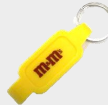
BOTTLE OPENER 2 POINTS