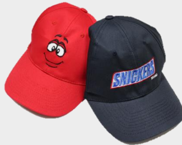
BASEBALL HAT 15 POINTS