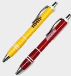
BALLPOINT PEN 4 POINTS