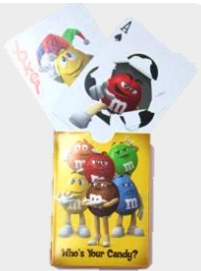
PLAYING CARDS 8 POINTS