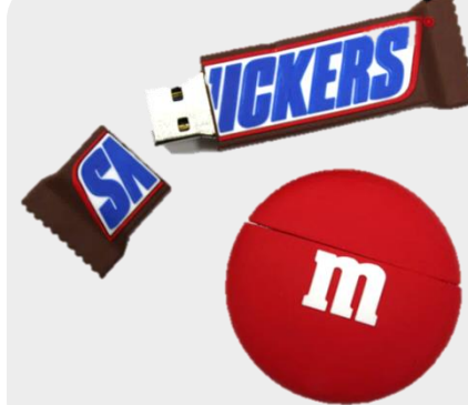
USB STICK 8 POINTS