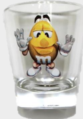
SHOT GLASS 14 POINTS