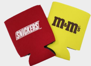
DRINK KOOZIES 4 POINTS

BRING YOUR M&M & SNICKERS WRAPPERS TO BUTTERFIELD & VALLIS, ORANGE VALLEY ROAD, DEVONSHIRE. OFFER GOOD WHILE SUPPLIES LAST. 1 POINT = 1 WRAPPER OR BAG